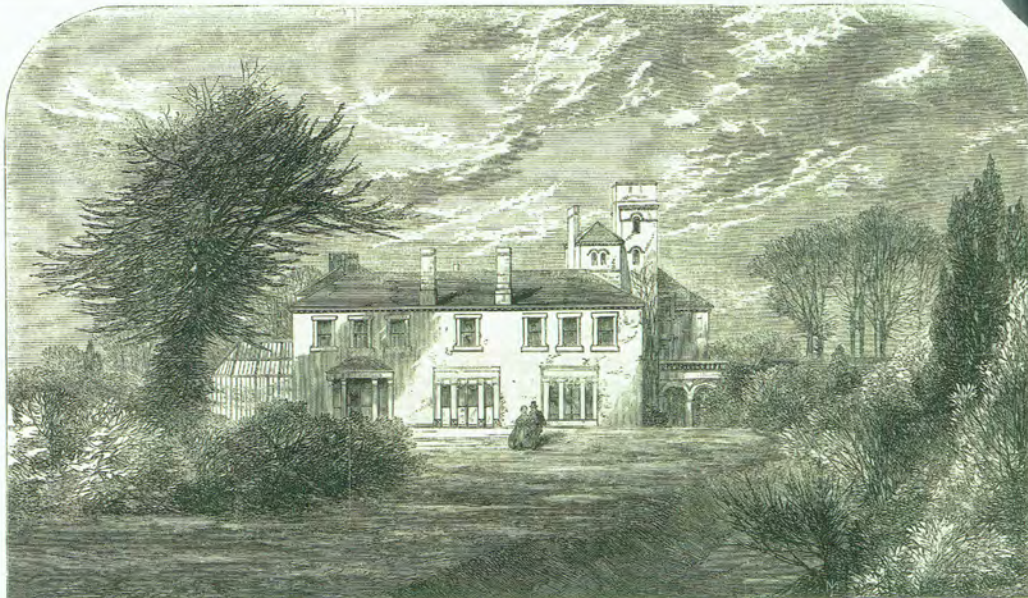
DUNFORD HOUSE, MIDHURST, SUSSEX, THE BIRTHPLACE AND RESIDENCE OF MR. COBDEN.—SEE NEXT PAGE.